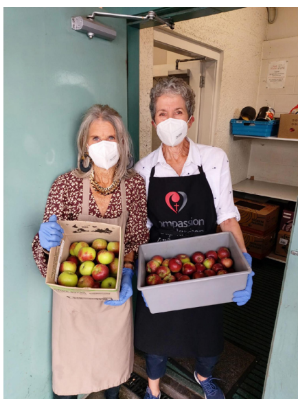
Apples delivered to the Compassion Soup Kitchen!